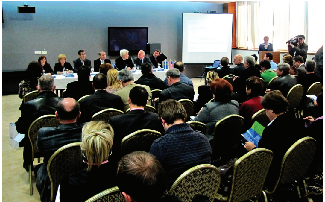
ABOVE Qualified Business Consultants Symposium in Sarajevo.

"We believe this QBFC program could help companies