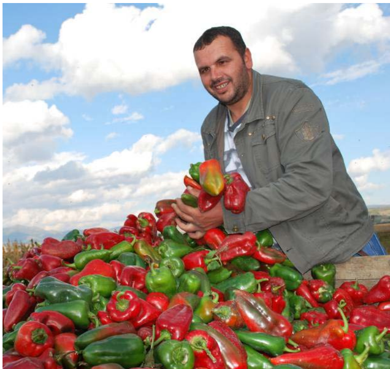
ABOVE A farmer inspects his pepper yield. KPEP purchased pepper planting machines for farmers in the village of Krusha e Madhe.

Nearly 200 farmers, members of Perdrini Association in Krusha e Madhe in Kosovo, have significantly improved their situation in this past pepper season thanks to the USAID Kosovo Private Enterprise Program (KPEP). KPEP assisted them with the purchase of pepper planting machines,