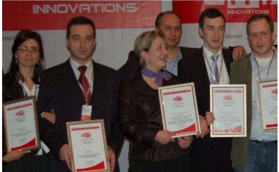
ABOVE Participants receive awards at the first Georgia IT conference.

More than 200 participants from 10 countries participated in the 2-day conference aimed at sharing IT best practices in the public and private sectors. Participants viewed presentations of successful IT projects and solutions from Georgia, Estonia, Bulgaria, and Armenia. Five awards for private sector initiatives were also presented. RCI contributed to the conference by funding the participation of speakers from the