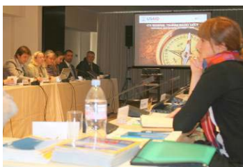
ABOVE Roundtable in Podgorica

On October 1 RCI held its Fourth Regional Tourism Round Table in Podgorica, Montenegro with 36 participants from eight countries. The current issue of the event was traditionally dedicated to information sharing and exchanging ideas on successful developments in tourism in South East Europe. The 36 tourism specialists participating from Bosnia and Herzegovina, Bulgaria, Croatia, Kosovo, Montenegro, Serbia, and USA applied their knowledge and experience into discussing