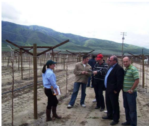
ABOVE Tour participants visit a vineyard in California to learn about advanced grape producing techniques. The tour combined classroom training with on-site visits.

Macedonia's largest grape exporters had the unique opportunity to visit one of the largest wholesale produce