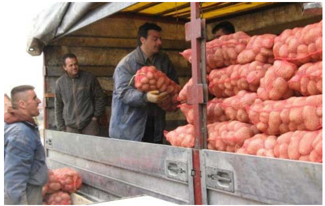
ABOVE Workers unload potatoes. KPEP identified buyers for 1000 MT of potatoes.

The $17.8 million USAID-funded Kosovo Private Enterprise Program (KPEP) is a four-year initiative launched in October 2008. Its goals are to promote improved quality and efficiency of locally produced goods and services, expand